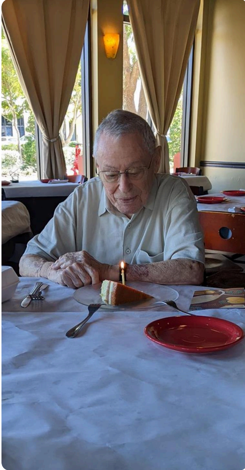
We will Miss you